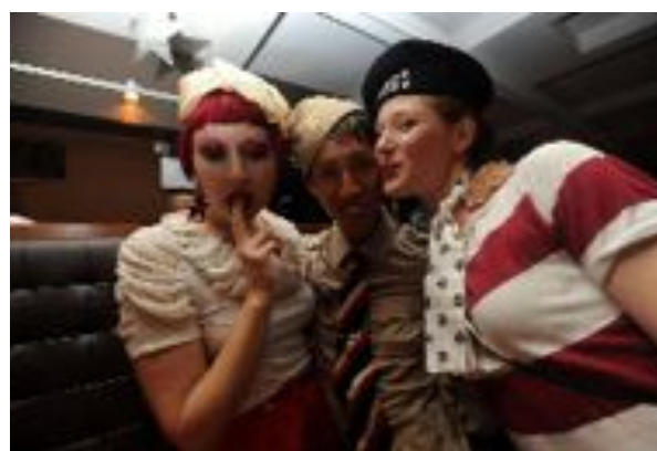
Guests at The Liberty Belle Spectacular on July 4, 2010.