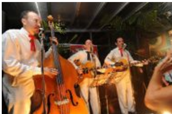
Sit & Die Co. perform at The Liberty Belle Spectacular on July 4, 2010