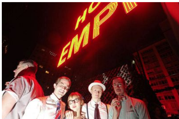
Guests at The Liberty Belle Spectacular on July 4, 2010