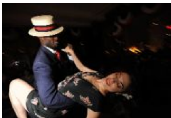
Guests at The Liberty Belle Spectacular on July 4, 2010.