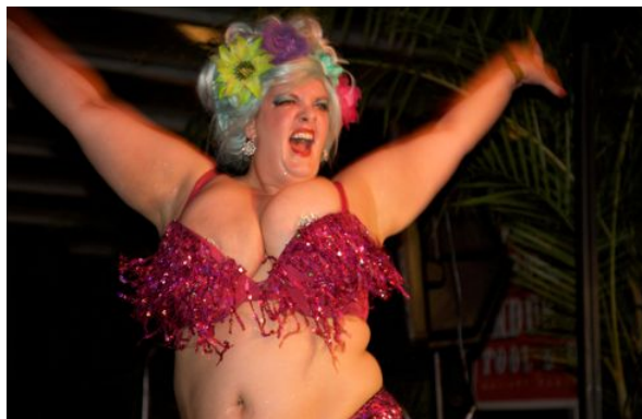
Jezebel Express at The Liberty Belle Spectacular on July 4, 2010.