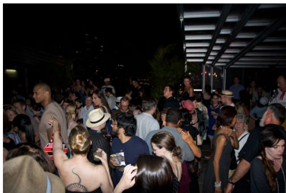
Guests at The Liberty Belle Spectacular on July 4, 2010.