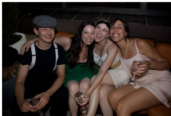
Guests at The Liberty Belle Spectacular on July 4, 2010.