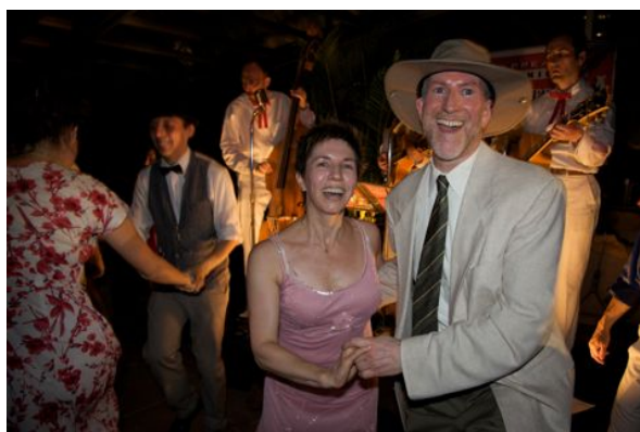
Guests at The Liberty Belle Spectacular on July 4, 2010.