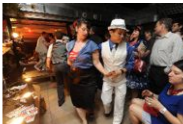
Guests at The Liberty Belle Spectacular on July 4, 2010.